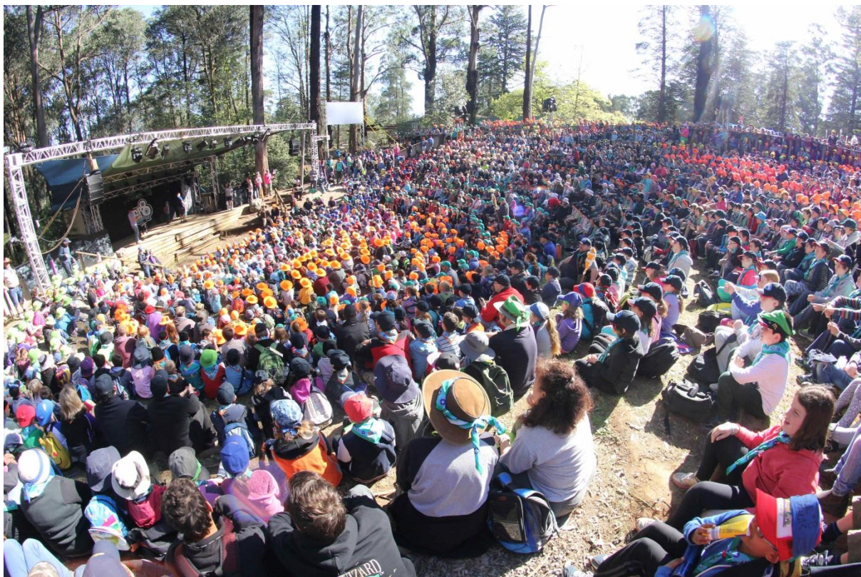
Cuboree, attended by 9 of our Cubs and 3000 others!