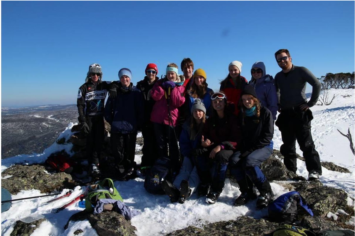
Blazing sunshine and awesome views on Snow Venture