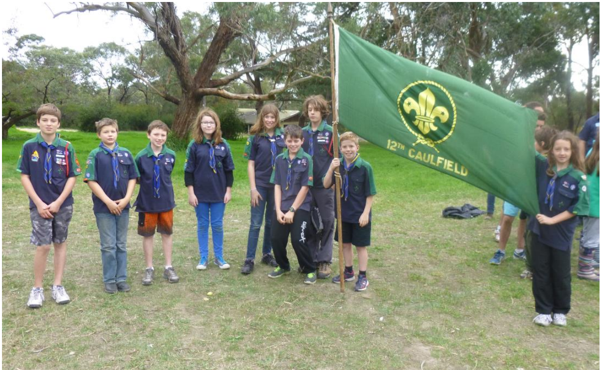
Stradbroke Cup Camp – some of our Scouts at Final Parade