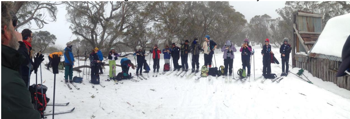
Snow Venture Parade

So while we are not all planning seriously a compulsory checklist for the Queen Scouts Award, the (12th Caulfield) Hopetoun Venturer Unit is committed to helping out the Scouting community, getting physical and having fun! It's been great in 2014 to work with 'a bunch of teenagers to do what we've done this year.